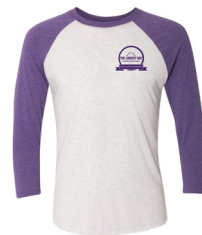
Solstice Champions shirt