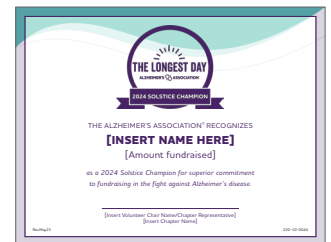
Solstice Champions Club certificate