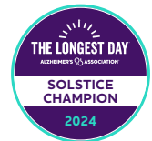
Solstice Champions lapel pin