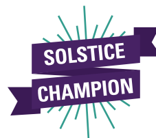
Solstice Champions fundraising badge