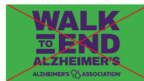
Do not place the logo on any background color other than white or our ALZ Purple*.