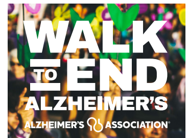
Reverse logo on photo