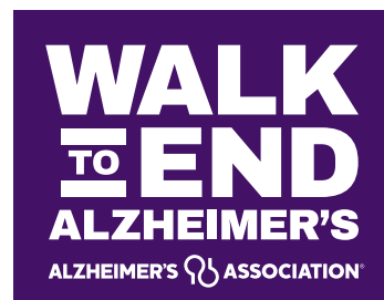
White on ALZ Purple* background