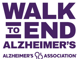
ALZ Purple* logo on white background