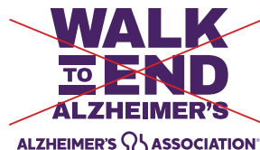
Do not change the size relationship of any of the elements of the logo.