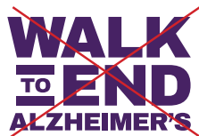
Do not separate the Association brandmark from the lockup.