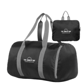
CORKCICLE® Classic Can Cooler or Packable Duffle