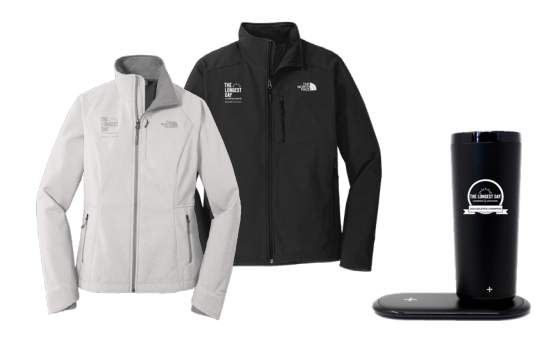
The North Face® Apex Barrier Soft Shell Jacket or TemperCharge Travel Mug