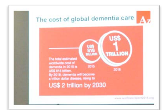
April 6, 2017 Radisson Hotel at Cromwell

Note: Continuing Education Credits available to Physicians, Nurses and Social Workers.