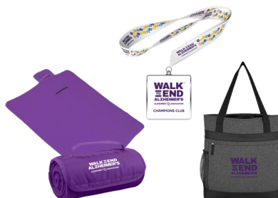
Fleece travel blanket (48" x 53") or polycanvas tote bag AND Champion medal