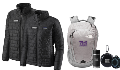
Patagonia® Nano Puff jacket** or YETI® 12-oz Hotshot Bottle, BBTEK Lightshow waterproof speaker and The North Face® connector backpack