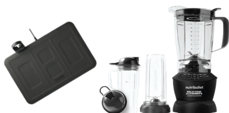
mophie® 4-in-1 universal wireless charging mat or nutribullet® blender combo