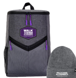
Insulated cooler backpack or The North Face® fleece-lined beanie