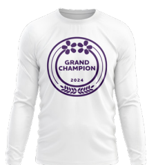
Folding captain's chair or mophie® Power Boost 10,000 mAh Power Bank AND Grand Champion Team 365 Zone performance long-sleeved T-shirt