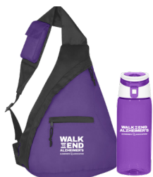
Crossbody sling backpack or shatter-resistant flip-top sports bottle