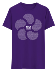
2024 Walk to End Alzheimer's participant T-shirt

You must be a registered participant to earn incentive gifts. Register for a Walk to End Alzheimer's® event in your area at alz.org/walk .