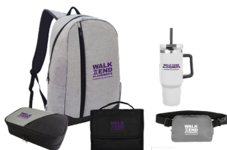
Laptop backpack, toiletry bag and tech organizer or belt bag and 40-oz stainless steel tumbler