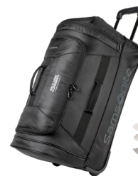
Samsonite® wheeled duffel bag or Cuisinart® bamboo 13-piece grill set AND Elite Grand Champion Clique Lift Eco Performance unisex crewneck sweatshirt