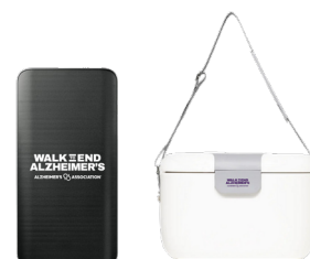
Sonos® One SL speaker or 13-quart Corkcicle® Chillpod