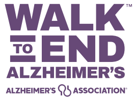
EXHIBIT B: ASSOCIATION MARKS