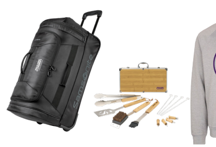
Samsonite® wheeled duffel bag or Cuisinart® bamboo 13-piece grill set AND Elite Grand Champion Clique Lift Eco Performance unisex crewneck sweatshirt