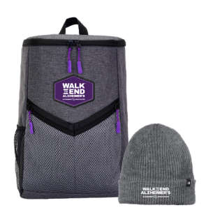
Insulated cooler backpack or The North Face® fleece-lined beanie