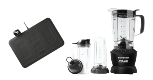
mophie® 4-in-1 universal wireless charging mat or nutribullet® blender combo