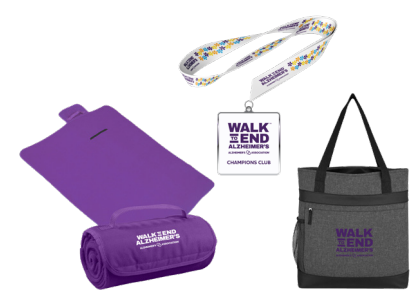
Fleece travel blanket (48" x 53") or polycanvas tote bag AND Champion medal